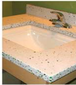
Recycled Glass Counter top