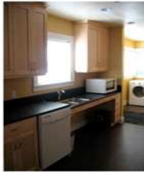
Recycled Paper Counter tops