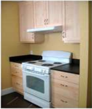
Green Core 100% Recycled Wood Casework from Non-tropical Woods