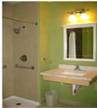
Low-Flow, High-Efficiency Plumbing Fixtures