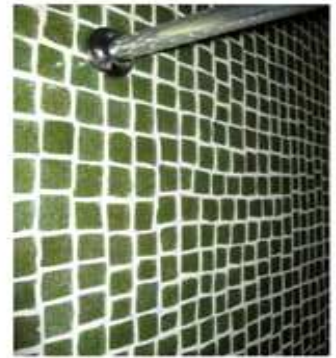
Recycled Glass Tile in Shower