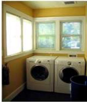
Energy Star Appliances and Lighting